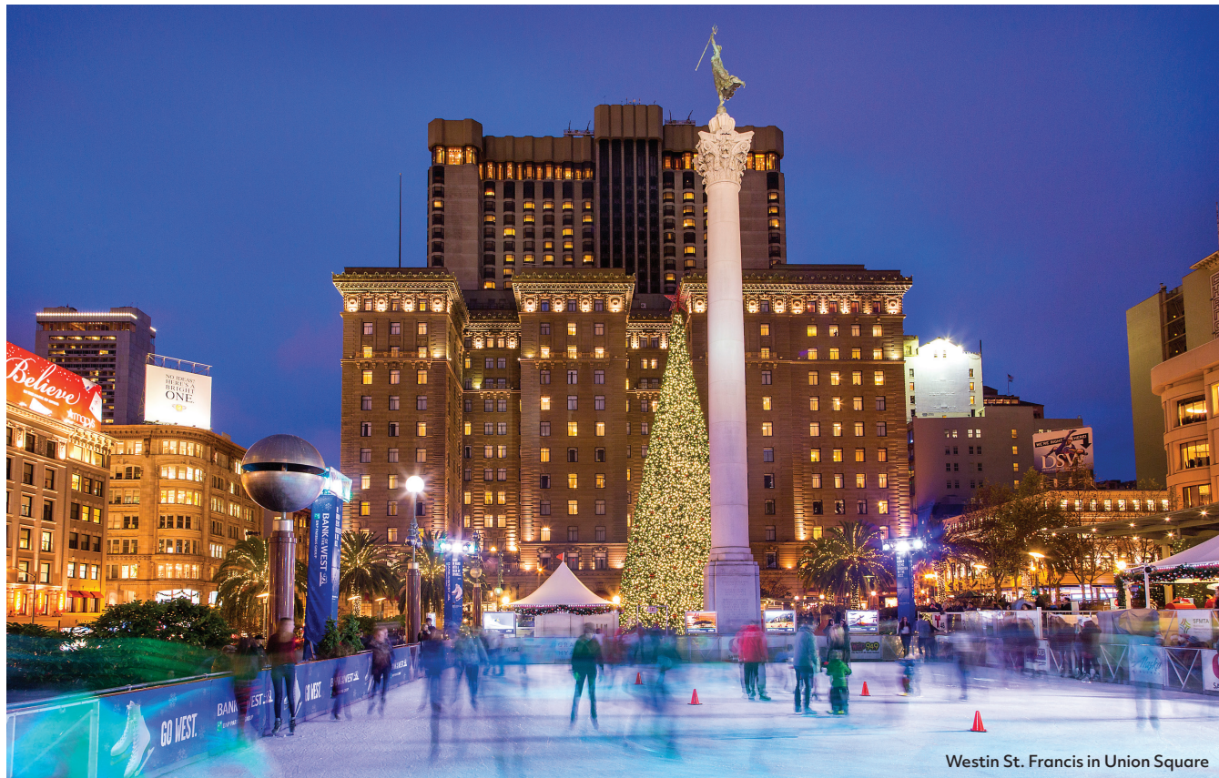
Westin St. Francis in Union Square