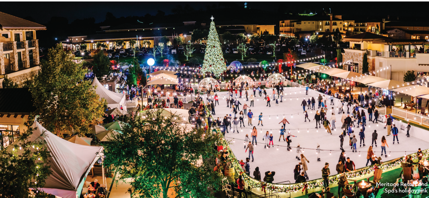
Meritage Resort and Spa's holiday rink